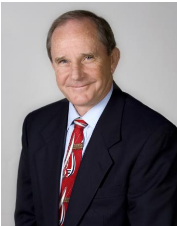
Senator Lowell Barron

“ATP Update and Legislative Session” Senator Lowell Barron Monday, August 16 3:00-4:30 PM Alabama A